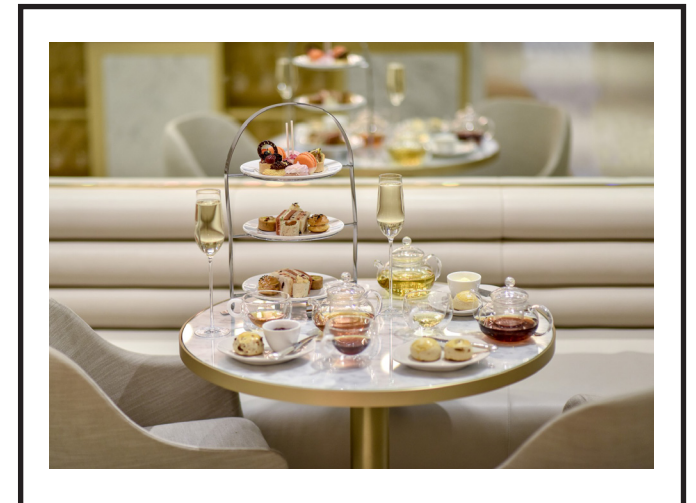
50 points Royal Lancaster London

Champagne Signature Afternoon Tea for two at the Lounge Bar