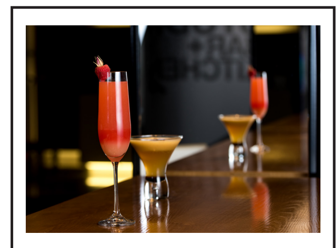
20 points K West Hotel & Spa Two signature cocktails at Studio Bar