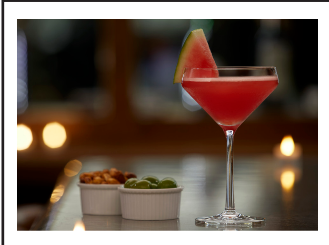
20 points The Landmark London Two of your favourite cocktails at twotwentytwo