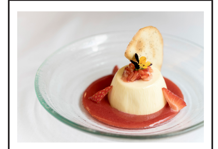
20 points Royal Lancaster London Complimentary starter/dessert and a glass of wine when you have dinner at Island Grill OR cocktails for two at Island Grill