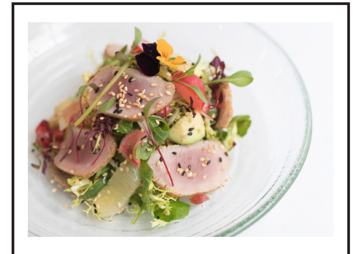
100 points Royal Lancaster London

A three-course dinner for two, inclusive of a glass of Prosecco, at Studio Kitchen