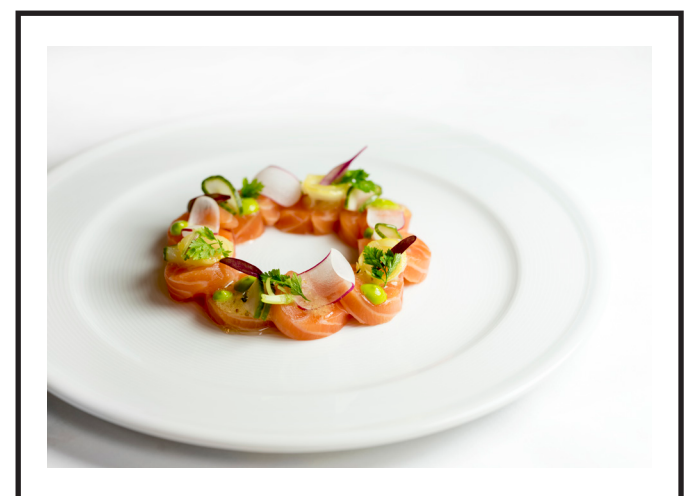
100 points The Landmark London

A three-course dinner inclusive of a bottle of wine for two at Island Grill