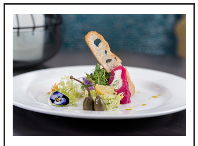
75 points K West Hotel & Spa

A three-course dinner for two, inclusive of a glass of Prosecco, at Studio Kitchen