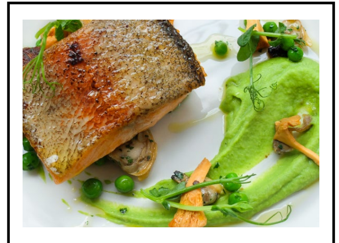
100 points Royal Lancaster London

A three-course dinner for two, inclusive of a glass of Prosecco, at Studio Kitchen