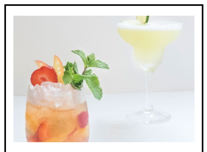
20 points Royal Lancaster London

Complimentary starter/dessert and a glass of wine when you have dinner at Island Grill OR cocktails for two at Island Grill