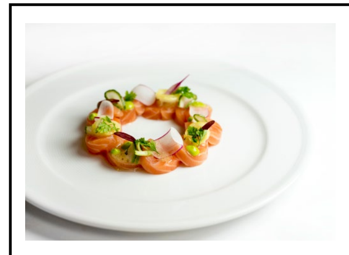
100 points The Landmark London

A three-course dinner inclusive of a bottle of wine for two at Island Grill