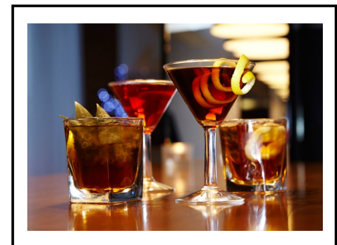
20 points K West Hotel & Spa

Two of your favourite cocktails at twotwentytwo