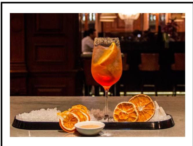
20 points The Landmark London

Complimentary starter/dessert and a glass of wine when you have dinner at Island Grill OR cocktails for two at Island Grill