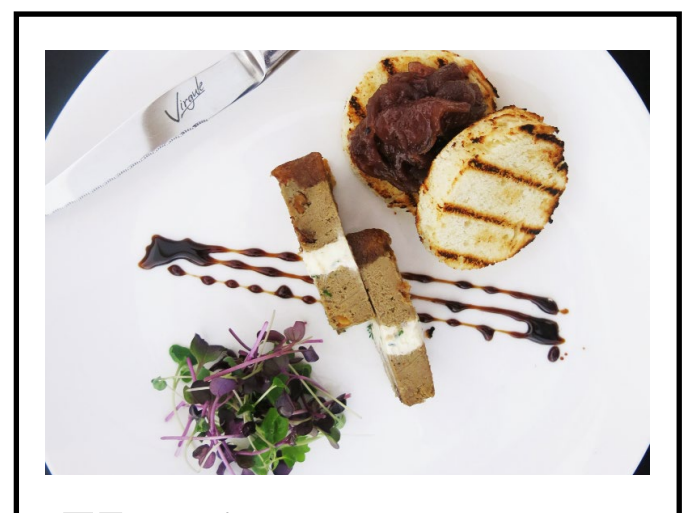
75 points K West Hotel & Spa

A three-course dinner for two, inclusive of a glass of Prosecco, at Studio Kitchen